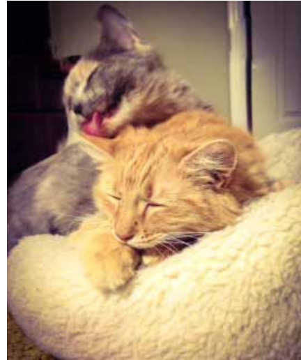
Pippin and Skittle